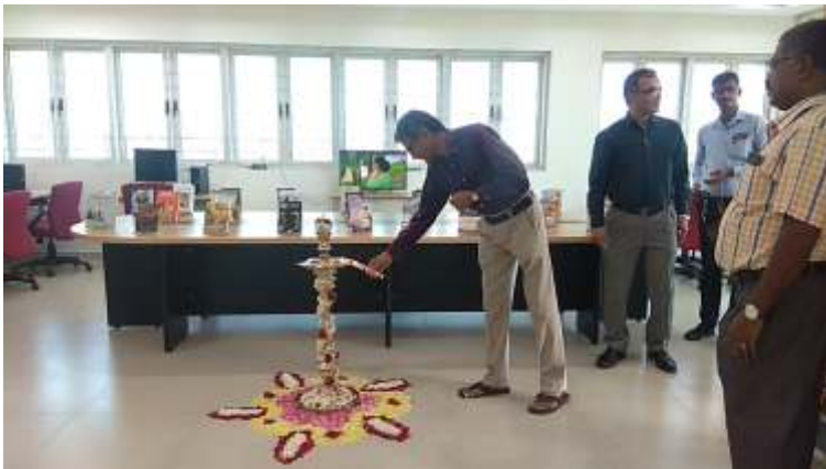
Matribhasha Diwas celebrated at IIMT