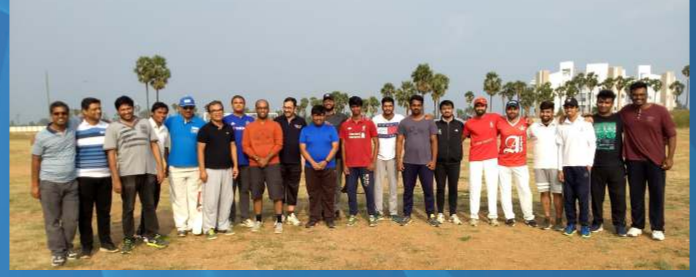
Faculty members and students after the cricket match

IIM Trichy Sports Committee continues the legacy of organizing the Faculty-Student Cricket match. This year the faculty student match was conducted on 6<sup>th</sup> January 2019 to mark the inauguration of ITCL. Both the teams played well and were highly motivated. Eventually, the students team won the match by 36 runs.