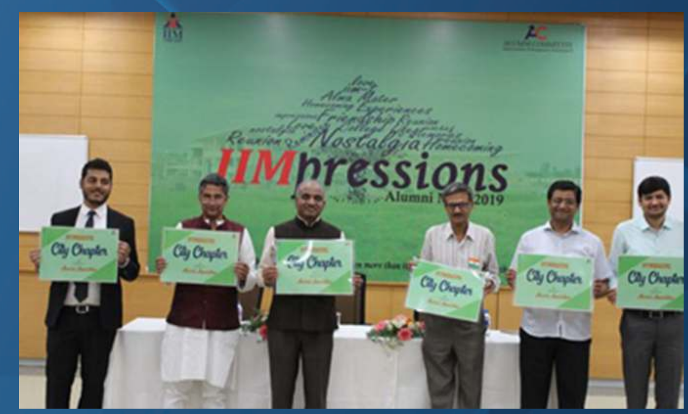
Launch of city chapters at Alumni Meet