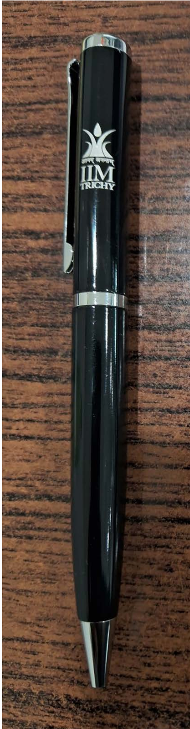
Model Pen with Engraving of IIMT Logo