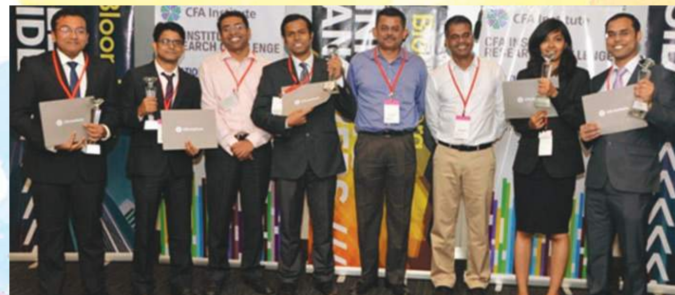
The successful IIMT team at the CFA Institute Research Challenge