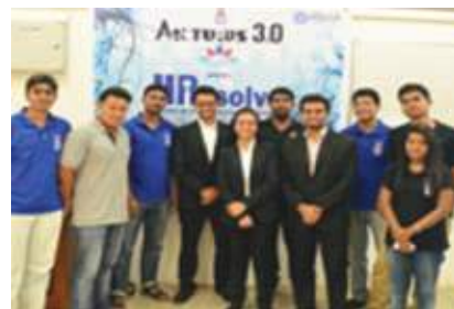
Persona Team with winners at HR event HResolve