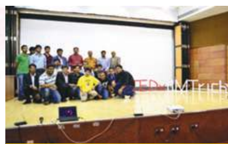
Organizing team with the speakers

On the 14th of February 2015, the TEDx Committee of IIM Trichy conducted the TEDx event for the second time (TEDx 2.0). The theme of this year's event was "Change the Game." The event received a good response, with students and faculty members from IIM Trichy, NIT Trichy and BIM Trichy turning up in good numbers.