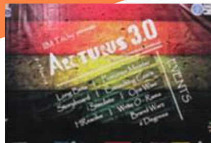
Arcturus 3.0 Main Banner during Inauguration Ceremony