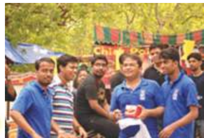
B-Fest Committee members during on the spot events