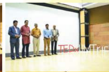
The speakers at TEDx

A total of six speakers from diverse backgrounds presented their ideas in the event.