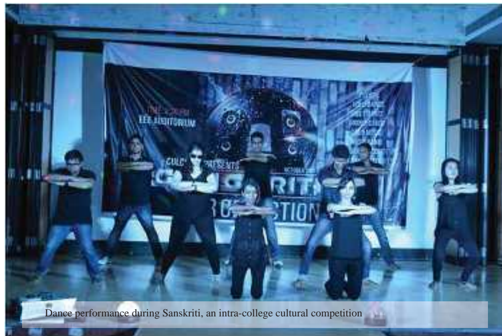
Dance performance during Sanskriti, an intra-college cultural competition

The cultural committee of IIM Trichy, organized Sanskriti, an intra-college cultural event, where students competed in song and dance performances, skits, and fashion shows.