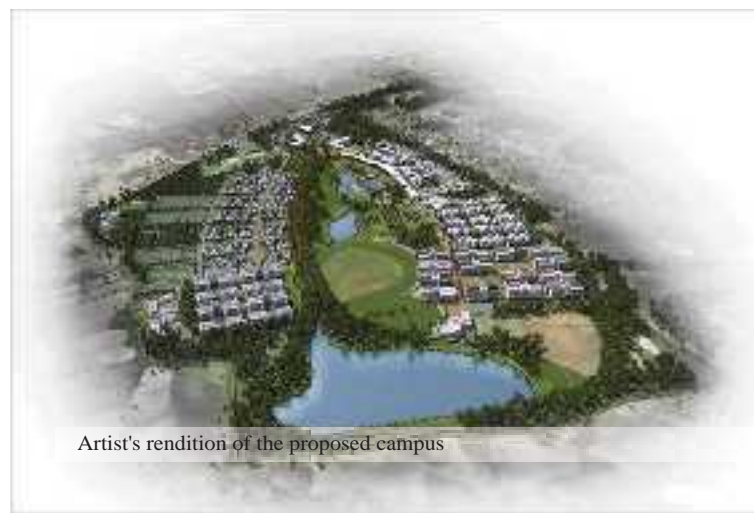
Artist's rendition of the proposed campus