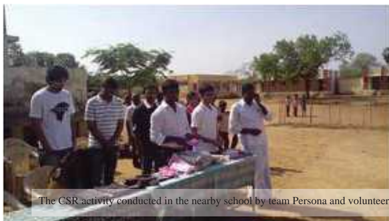
The CSR activity conducted in the nearby school by team Persona and volunteers