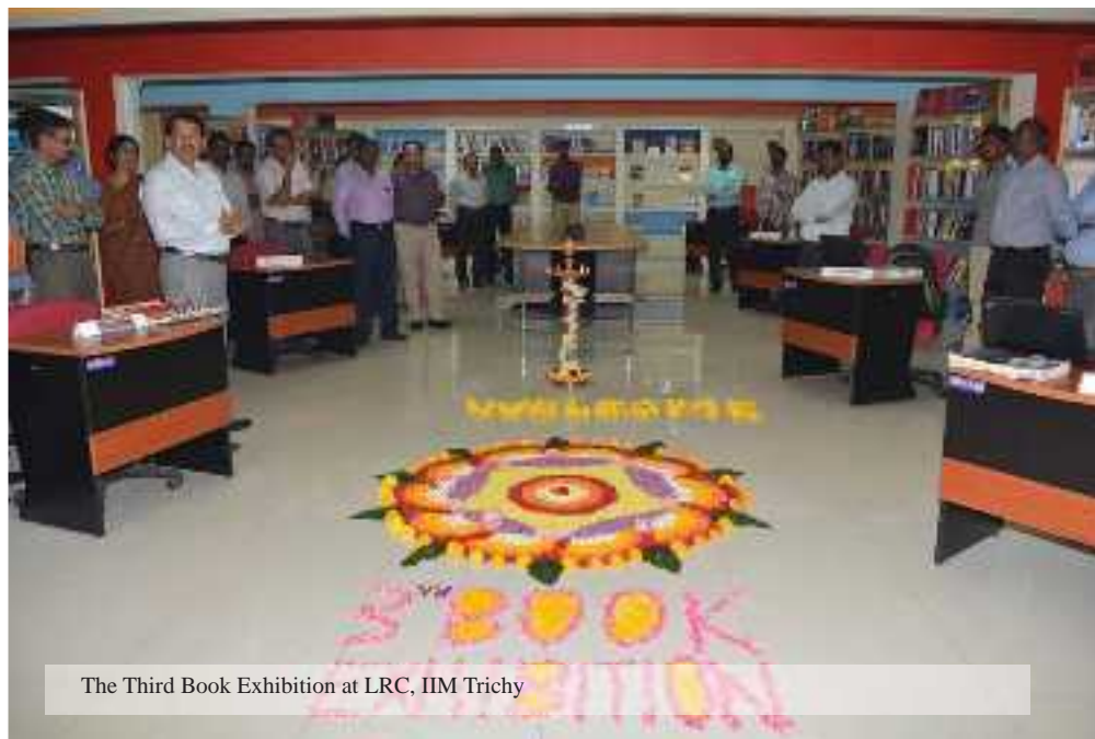
The Third Book Exhibition at LRC, IIM Trichy

The Learning Resource Centre at IIMT organized its Third Book Exhibition on September 16, 2014. Faculty members, students and staff actively participated and recommended more than 500 books. While electronic resources are important, physical books enrich the library space, and also provide opportunities for serendipitous learning. The addition of these new titles is sure to attract more students to the LRC.