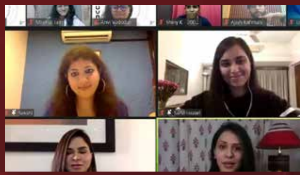
Entrepreneurs speak to students at Dhruva '21