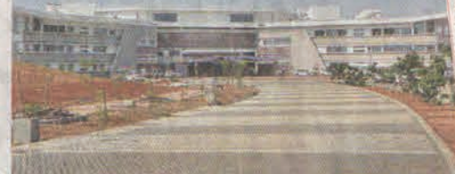
A view of the new permanent campus of Indian Institute of Management in Tiruchi which was inaugurated by Prakash Javadekar, Union Minister of Human Resource Development, through video conference from New Delhi on Monday.

The Central government had brought in a new IIM Bill to grant complete autonomy to these institutes. The Minister said after declaring open the permanent campus of IIM, Tiruchi, through video-conference from New Delhi. Exuding confidence that the bill would be cleared in the Parliament by next