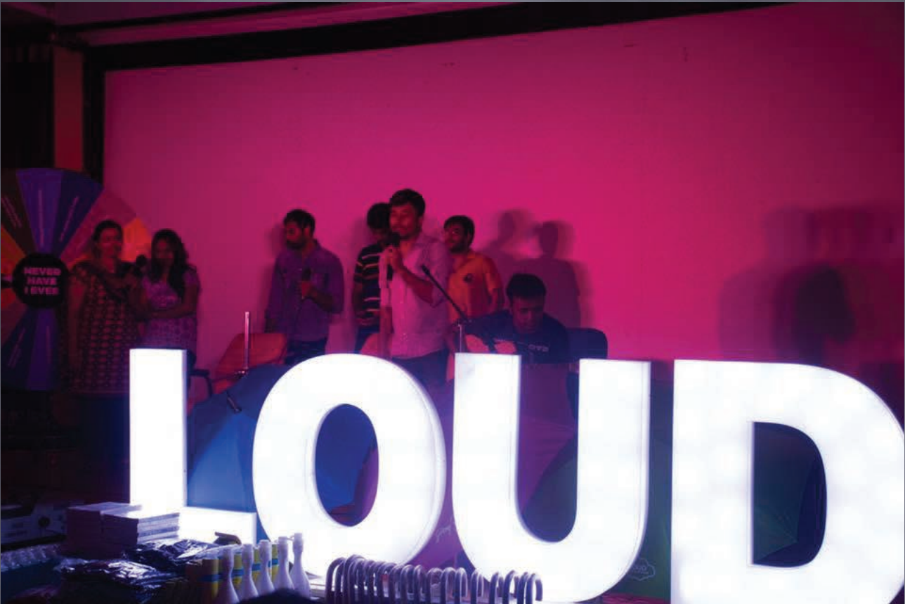
Students organize an event as part of Godrej LOUD